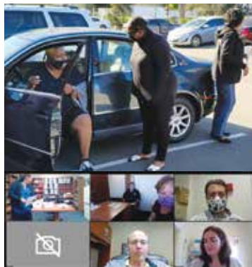
Top: Durham's drive-by ratification; Bottom: Zoom ballot count

As for the future of the pandemic, Aloise has some advice: "Keep wearing your masks. Wash your hands. Follow the guidelines. Do the best you can—this is not going away any time soon."