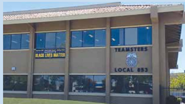
T: We proudly display a Black Lives Matter banner on our Oakland HQ; B: Members and staff participate in Strike for Black Lives event in July.