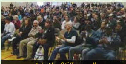
Join the 853 crowd!

San Leandro High School 2200 Bancroft Ave., San Leandro