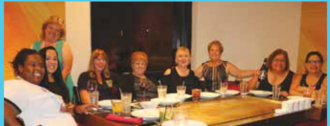
Local 853 staff and members joined more than 1,200 union members at the Teamster Women's Conference in Orlando in September.