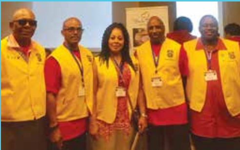
Local 853 staff and members attended the Teamsters National Black Caucus (TNBC) in Houston in August.